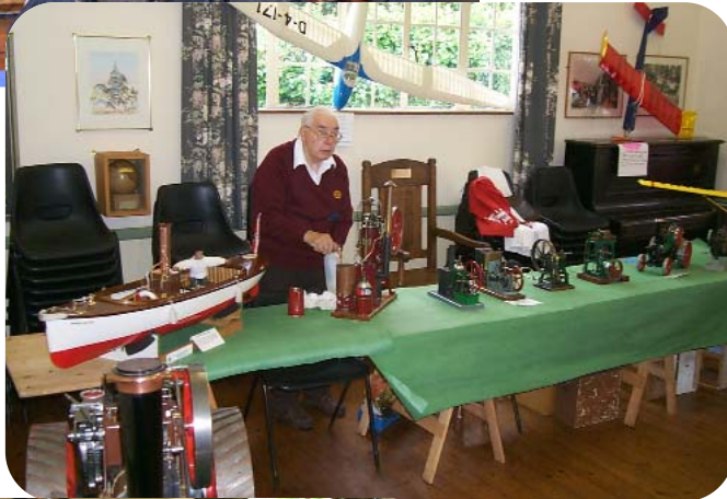
Model Exhibition September 2001