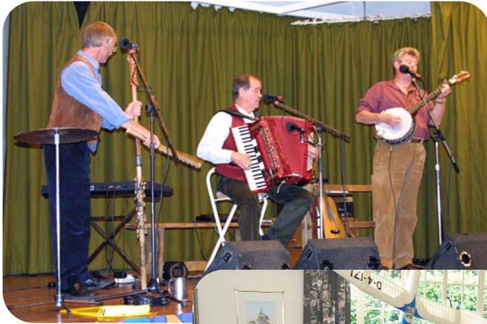
The Yetties in concert June 2003