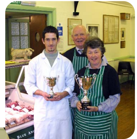
Exmoor Food Festival 2002 Home Farm winners and runners up of the Exmoor Sausage Challenge