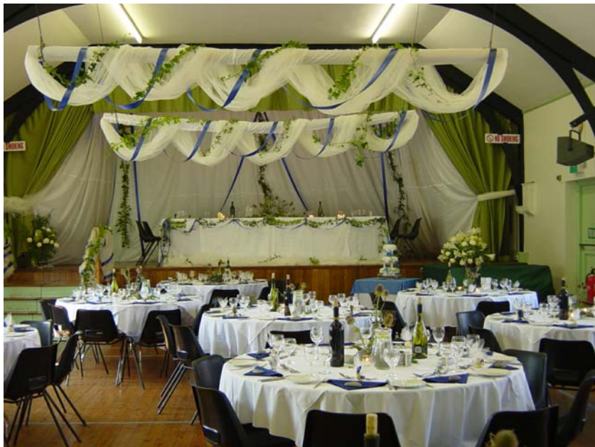
The large Hall decorated for a wedding by The Lorna Doone Hotel

Information for rates, booking forms, terms & conditions of hire and safety notes please go to www.pvh.org.uk