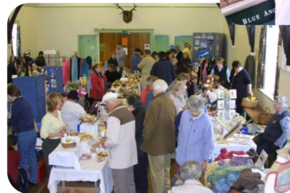
Quality Exmoor April 2003

REGULAR USERS include Porlock Parish Council, Porlock Ladies, Porlock Horticultural Society, Crib Club, Dog Training, Badminton, Barn Dancing, Antique Fairs, Sewing group, Pantomime & Drama Society, Under 5's.