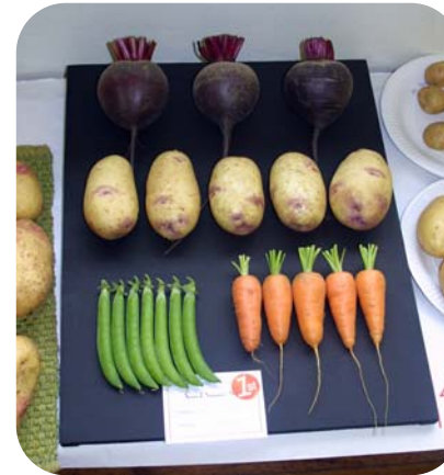
Porlock Horticultural Society Summer Show July 2003 Prize winning vegetables