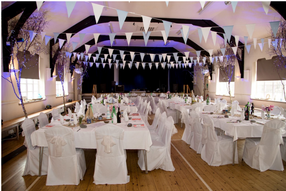
The large Hall decorated for a wedding.