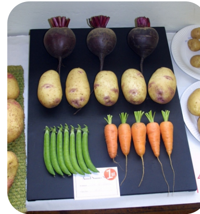
Porlock Horticultural Society Summer Show Prize winning vegetables